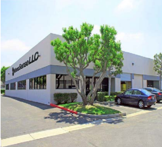
InnoSense LLC www.innosense.us